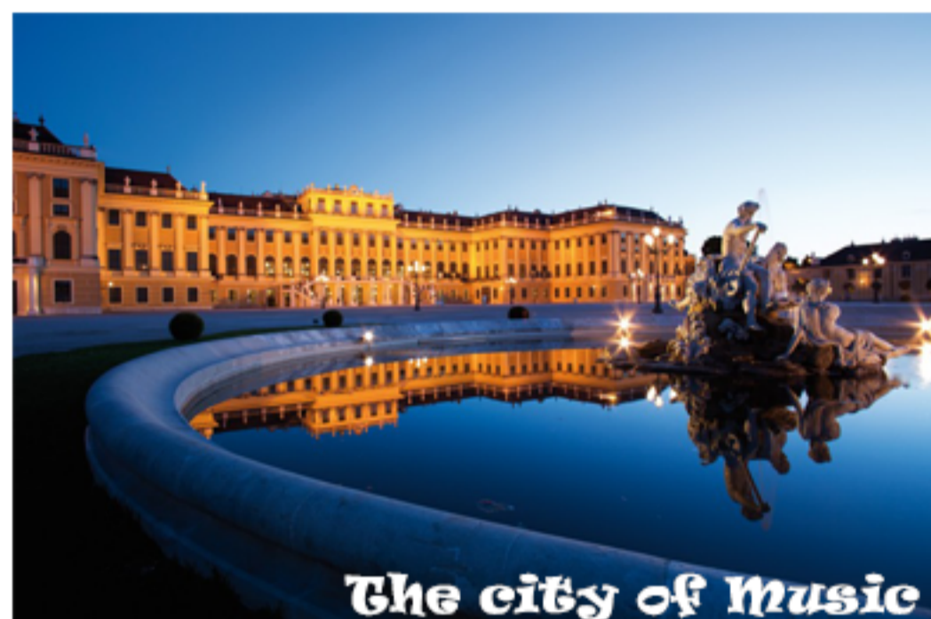
The city of Music