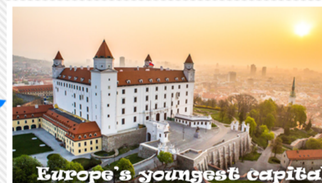
Europe's youngest capital